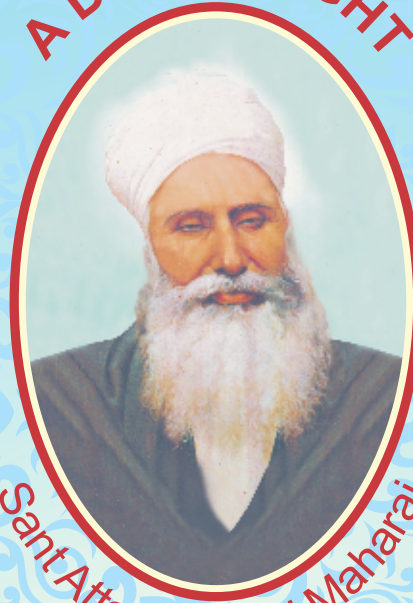
Sant Attar Singh Ji Maharaj